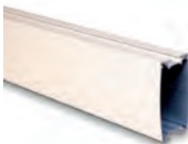
AC 630 / AC 640 / AC 650 ALUMINIUM RECTANGULAR BAR, RAL 9010. 3 / 4 / 5 M.