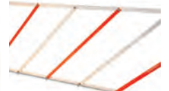
AC 590 2 M CURTAIN