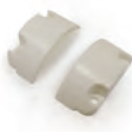
AC 700 BARRIER COVER PLUG