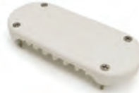
AC 710 BARRIER COVER PLUG