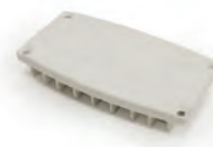
AC 715 BARRIER COVER PLUG