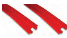
AC 670 / AC 680 / AC 690 RED BARRIER BAR COVER 3 / 4 / 5 M