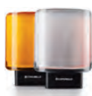
SWIFT LED BLINKING WARNING LIGHTS