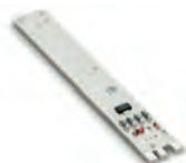
AC 770 INTERNAL LED LIGHTS