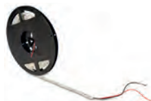
AC 800 5 M LED STRIP